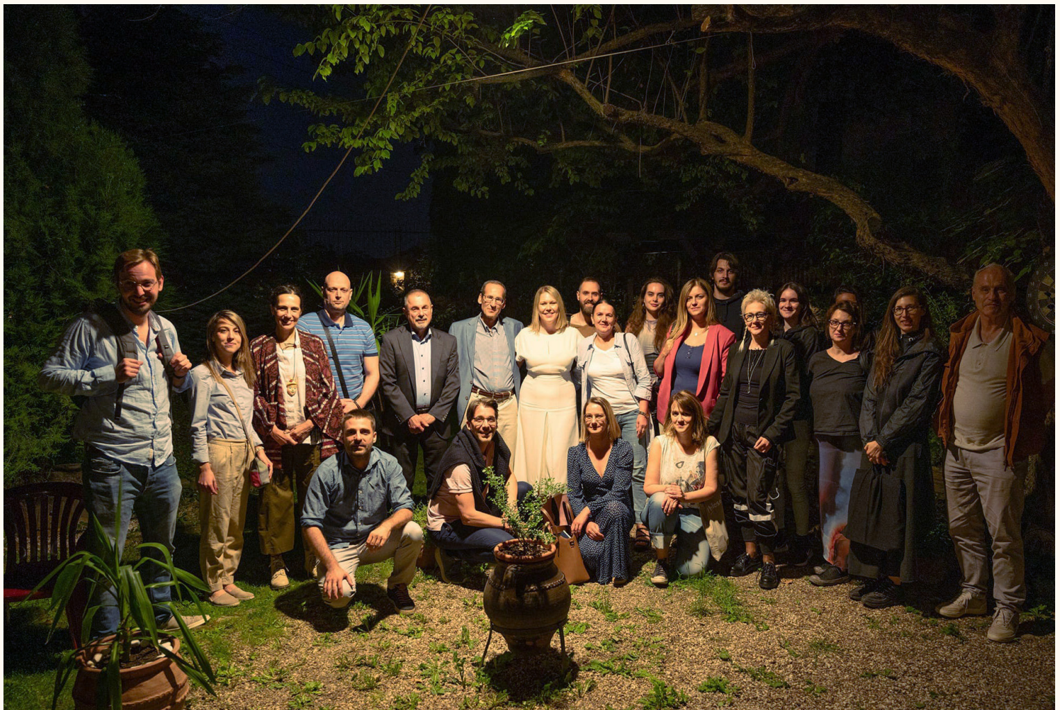
The final seminar of the study year 2023/24 led by Dr. Bruce Fink, Belgrade, May 18

At the end of the seminar, participants will be awarded a certificate of completion indicating the skills and knowledge they have acquired. The certificate award ceremony will take place on June 14, 2025.