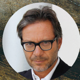
Dr Massimo Recalcati (Italy)